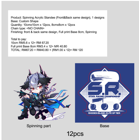
Image for invoice INV_20251110_045659_fd8d5c