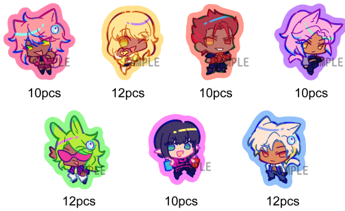
Updated image for invoice INV_20251118_032146_69627f