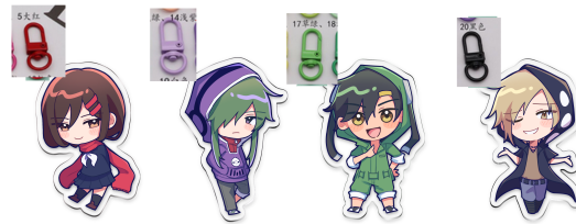
Updated image for invoice INV_20251118_032146_69627f