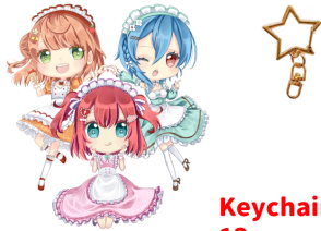
Keychain 10 cm 12 pcs

Image for invoice INV_20251124_041548_7337ef