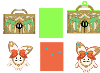
keychain 3cm Semi transparent 60% 10 pcs each no keyrings

Image for invoice INV_20251124_041548_7337ef