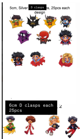
Image for invoice INV_20260327_094848_b9da31